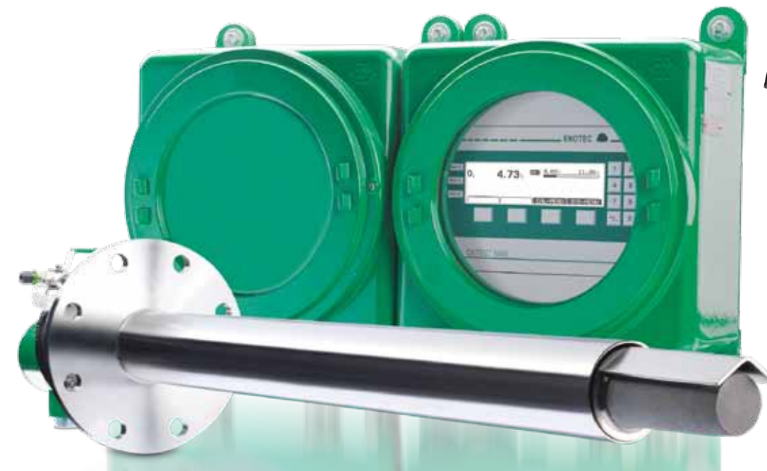
SME-5D electronic unit and KEX-5001 probe (immersion depth 464mm)

ATEX APPROVED FOR YOUR PROCESS CONDITIONS