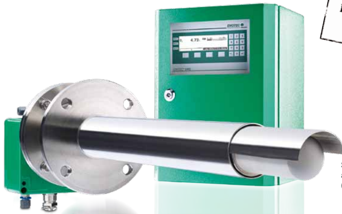
SME-53 electronic unit and KES-5001 probe (immersion depth 520mm)

REDUCE EMISSIONS AND INCREASE FUEL EFFICIENCY